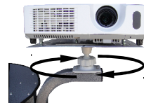
360° Projector Rotation